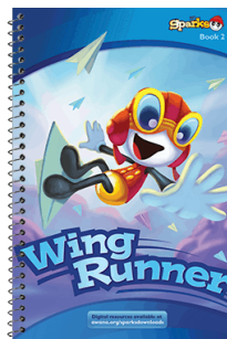
1 st Grade