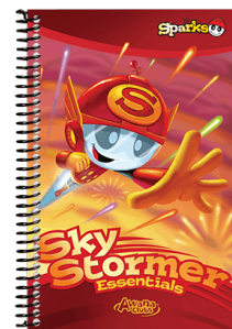
2 nd Grade

All newcomers to Sparks will complete an entrance booklet 'Flight 3:16' which centers on the gospel message of John 3:16 (the Sparks key Verse).